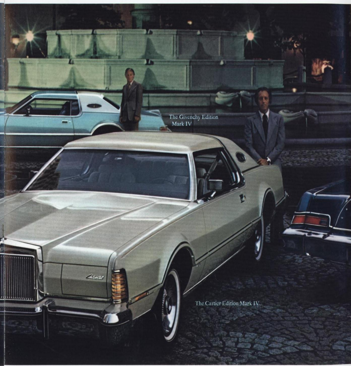
The Givenchy Edition Mark IV