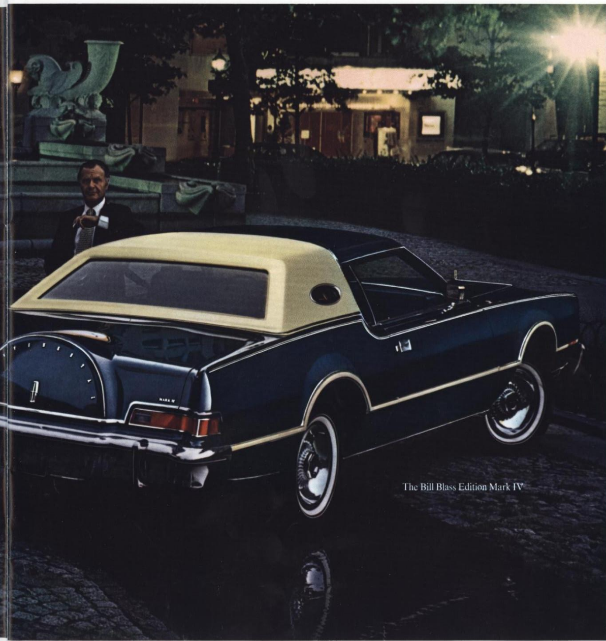
The Bill Blass Edition Mark IV