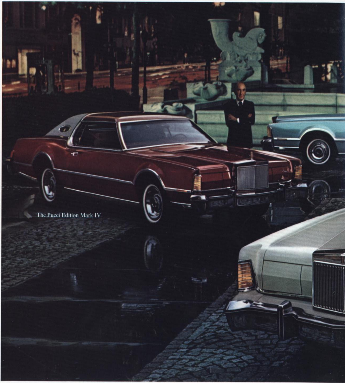
The Pucci Edition Mark IV